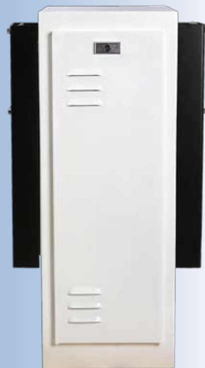
SG & SG-D Wishbone style arm 16'-25' long 115 or 230 VAC