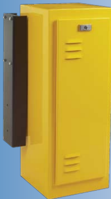
BGUS & BGUS-D Single arm 14'-18' 115 or 230 VAC