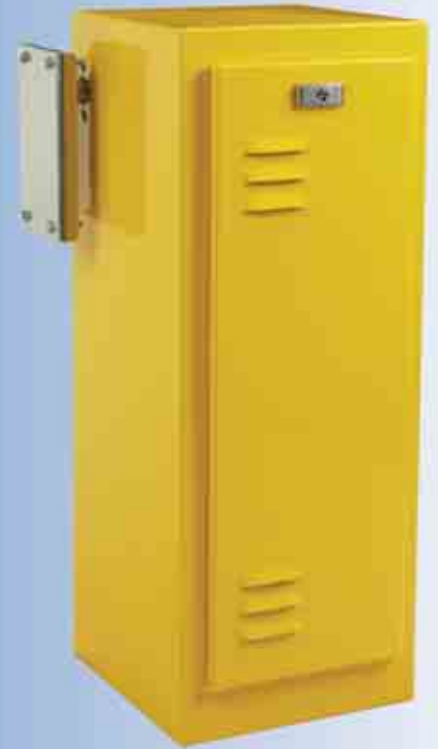
BGU 115 VAC